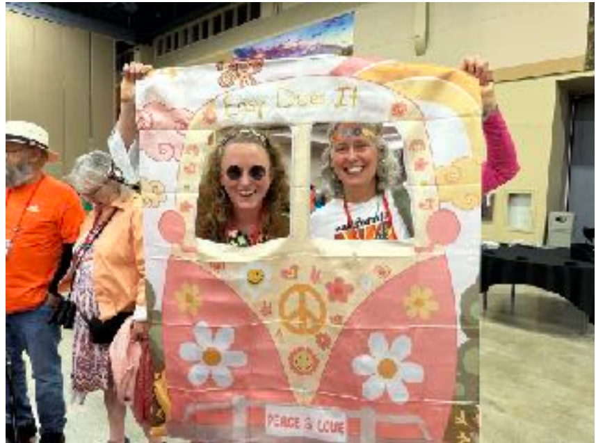
We're California Dreaming in our ersatz VW Microbus!