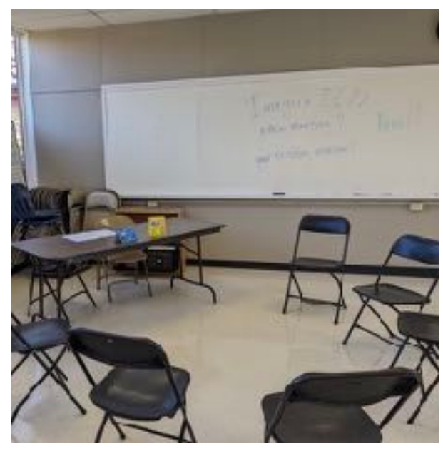
Room L-53 as set up for a program meeting.