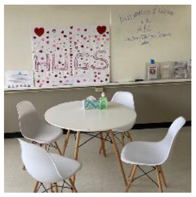
Room L-53 as set up for a small meeting,