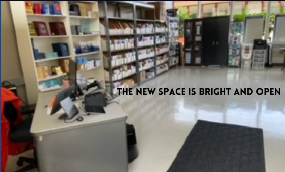
THE NEW SPACE IS BRIGHT AND OPEN

Help us Celebrate this momentous occasion